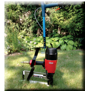
Pneumatic Stapler Walking Stick

The WP150 Walking stick has been updated again to fit our pneumatic stapler. The walking stick can be quickly removed from the pneumatic stapler for tight areas.