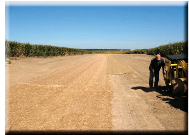
Erosion Blanket Installed on Waterway Project